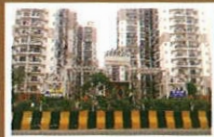
Actual Site Picture JM Orchid - Noida