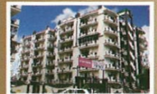
Actual Site Picture JM Royal Legacy - Vasundhara