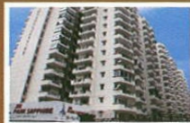
Actual Site Picture JM Park Sapphire - Vaishali