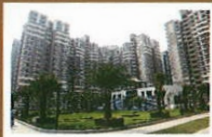
Actual Site Picture JM Aroma - Noida