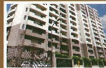
Actual Site Picture JM Royal Park - Vaishali