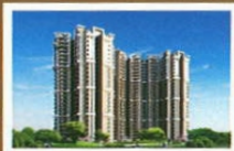
Proposed Elevation JM Florence- G. Noida (W)